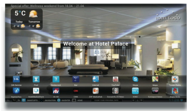
Full screen design

Each icon can represent a link to an embedded information page, a web or intranet page, an embedded PDF file or it can start an embedded video, and of course an icon can be a full tablet-based app.