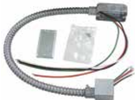
Hardwire Kit AYHW101