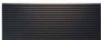
Architecture Grille - Dark Bronze AYAGALB01A