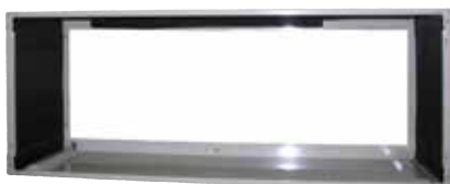
42" Wall Sleeve AYSVB01A