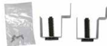
Leveling Legs (set of 2) AYLL101A