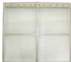
Replacement Filters 10-Pack AYFT110