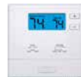
Digital Wireless Wall Thermostat PYRCUCC1HB For technical support & quality issue, please call 888-776-1427