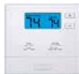
Digital Wired Wall Thermostat PYRCUCA0B For technical support & quality issue, please call 888-776-1427