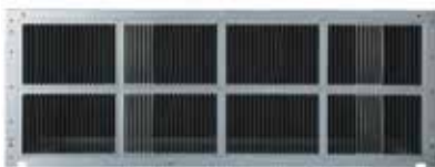
42" Stamped Aluminum Grille AYRGALA01