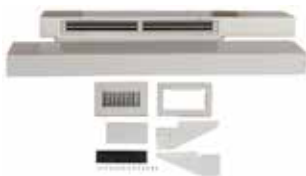
Lateral Duct Kit AYLD1A