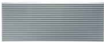
Architecture Grille - Soft Dove (soft beige) AYAGALC01A